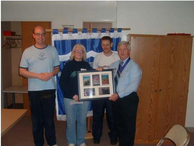
The Special Olympics Area 21 organization presents the Holy Rosary Council # 13579 with a gift of framed photographs of our area's athletes in action.